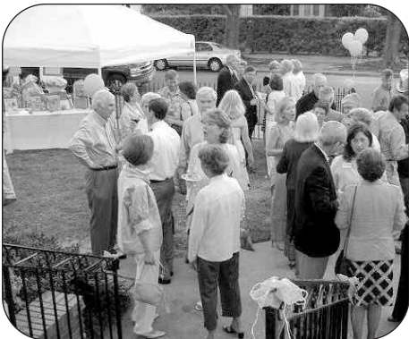
Guests enjoying A STAIR Affair.

What started as a gala event in October turned into a festive evening in April. Not even Katrina could stop the celebration! A STAIR Affair was a joyous one with blue skies, sunshine and 125 supporters, volunteers and friends coming together in high spirits to mark this benchmark year of our children's literacy program.