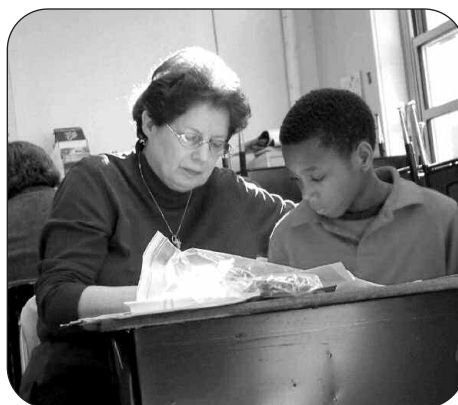
Tutor and student work together at new Westwego STAIR site.

Unfortunately, FEMA denied STAIR's claim for funding to recover its losses. Undeterred, STAIR applied for and received a Hurricane Katrina Bridge grant for $11,965 from the Foundation for the MidSouth to help us replace curriculum materials, equipment and supplies lost at the sites that were