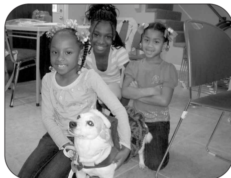
Fun with Reading to Rover at the STAIR site at Community Church Unitarian Universalist.

Christ, Community Church Unitarian Universalist, Dillard University, Dryades YMCA, Fischer Elementary School, Holy Angels Congregational Center, Lafayette Academy, Nelson UNO