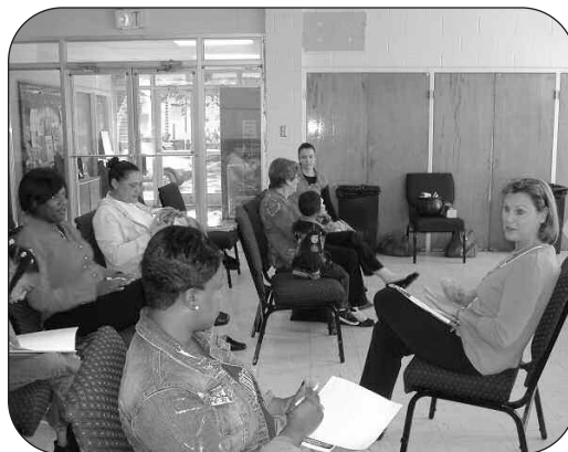
Parents and tutors receive information from the Parenting Center at the Family Reading Workshop at Berean Presbyterian Church.