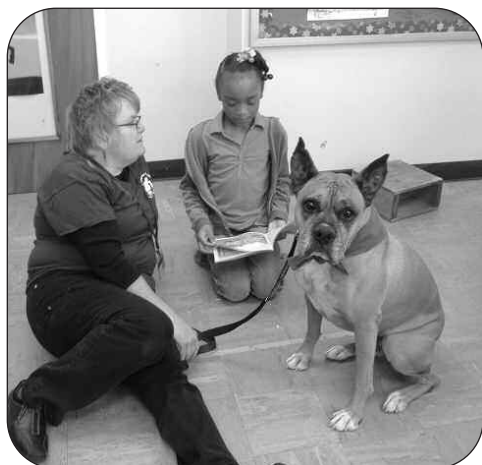
Reading to Rover at the STAIR site at Rayne Memorial United Methodist Church

highly correlated with reading comprehension. In order to comprehend what they read, children need to have good language skills, vocabulary and background knowledge AND they need to be able to read fluently.