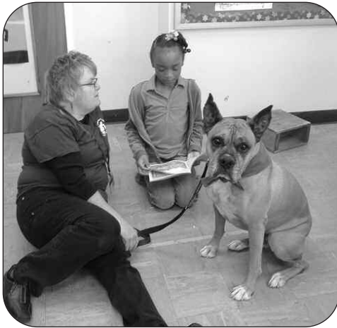
Reading to Rover at the STAIR site at Rayne Memorial United Methodist Church

With the 2007-2008 school year, STAIR began relying on the Dynamic Indicators of Basic Early Literacy Skills (DIBELS) testing scores to measure student improvement in reading. Since all participating schools use