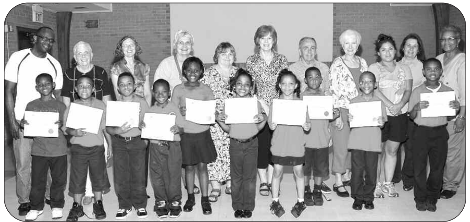
STAIR Graduation at Woodland Presbyterian Church in May 2010.

Marking its 25th anniversary in 2010, STAIR continues to be a successful children’s literacy program in the Greater New Orleans area providing free one-on-one after school tutoring in reading and language skills to at-risk second-grade public elementary school students as well as literacy support to family members. Founded in 1985, STAIR has brought more than 300,000 hours of dedicated volunteer service to its partner public schools to help nearly 6,000 New Orleans area students excel. As it has been for 25 years, STAIR is led by a strong all-volunteer Board of Directors and Advisory Council, staffed by qualified literacy administrators, and endowed with a volunteer force of more than 350 trained community individuals.